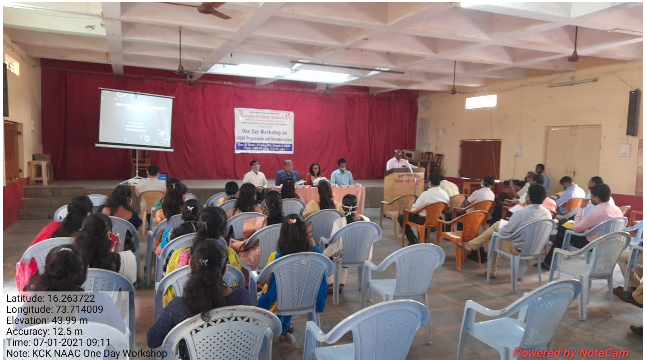
Participants present for workshop