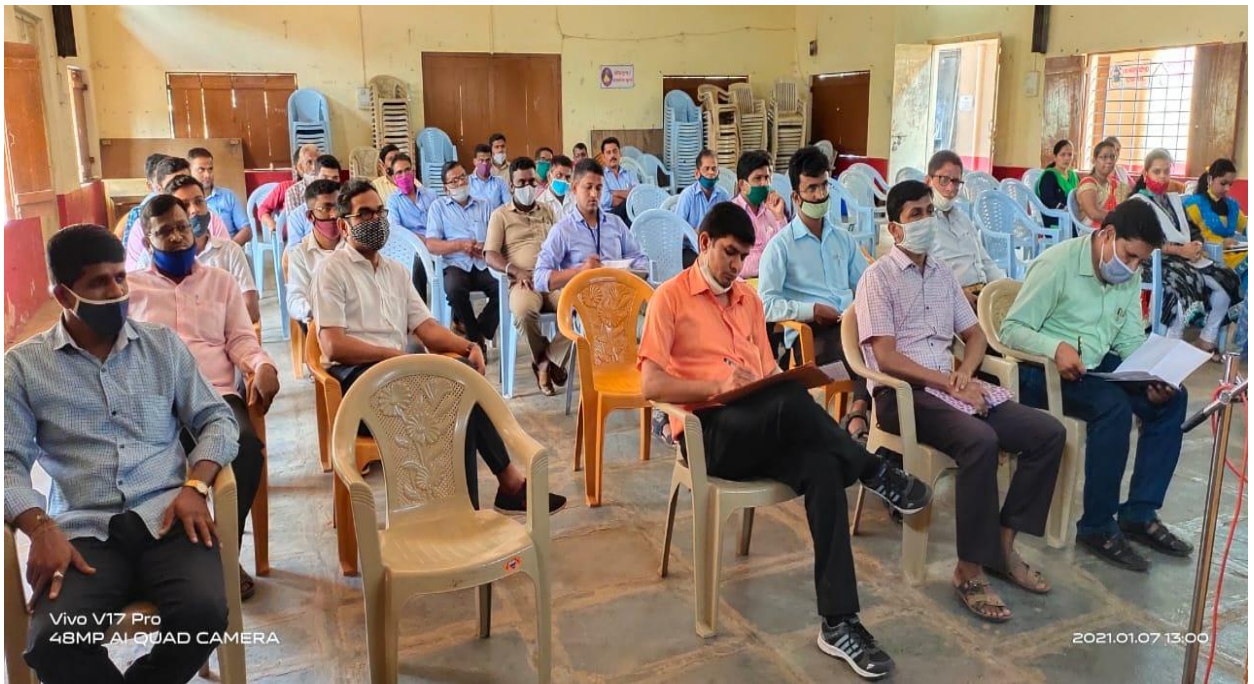
Participants present for workshop