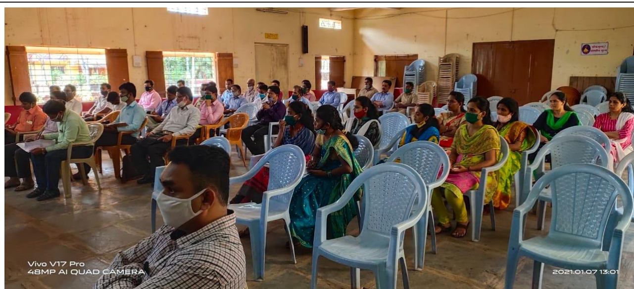
Participants present for workshop